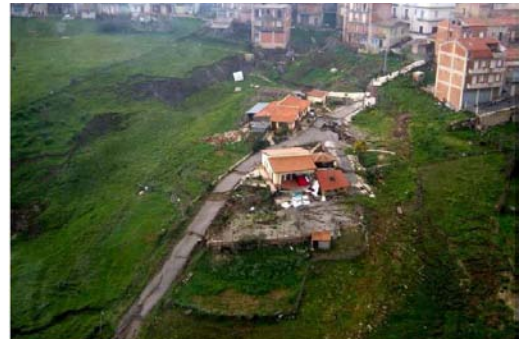
Figure 4. Aerial view of the San Fratello landslide

Again, the landslide is setting on a slope instability due to a precedent phenomenon dated 1922 [33].