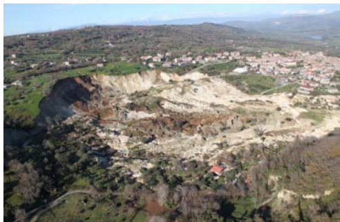
Figure 3. Aerial view of the Maierato landslide

The huge Maierato landslide involved a slope, which in its basal part is characterized by evaporitic calcarenites with interbedded silt, and silty clay (representing the predominant part of landslide body) topped by clay and silty clay with locally interbedded sands. The kinematics of the landslide occurred in a basin, already affected by major gravitational instability (such as the landslide of 1932, which affected the opposite slope of the valley), could be considered as complex rototranslational. Moreover, the same landslide under study, spreads over an area already accorded as a dormant landslide in IFFI archive. After the main event, a retrogression of the crown area was observed. The landslide, presents a width of 500 m and the estimated volume is about 1.7 millions m 3 [22].